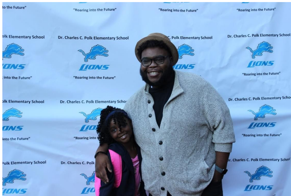
Students truly enjoyed Polk Elementary Schools “calling all men” breakfast and information session on Sept. 27.

Along with being served breakfast, parents had a chance to talk with school administrators and learn more about all of the exciting upcoming programs at the school.