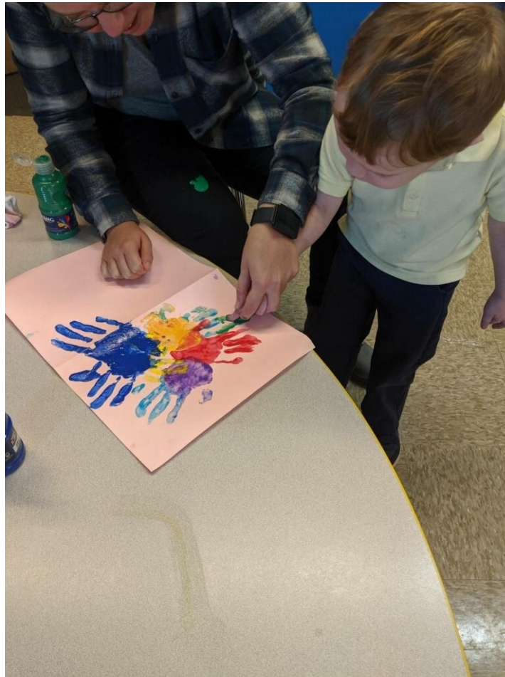
Preschool students enjoy finger painting as one of their sensory activities.

Creating art can help to expand a student's ability to interact with the world around them and helps to provide them with a new set of skills for both self-expression and communication.