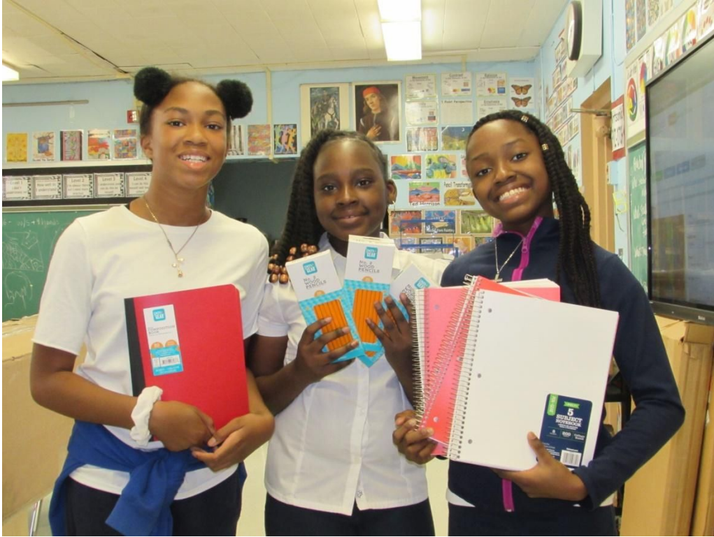
L.V. Moore students with supplies that will be donated to Hurricane Dorian victims.