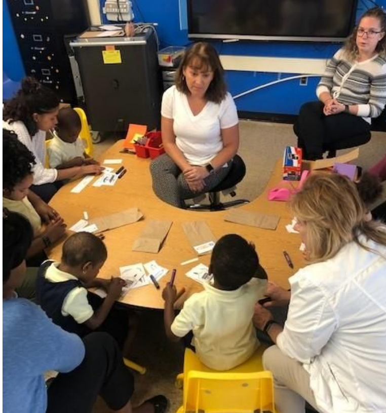
Teachers helping their students focus on Social and Emotional learning at the Preschool.