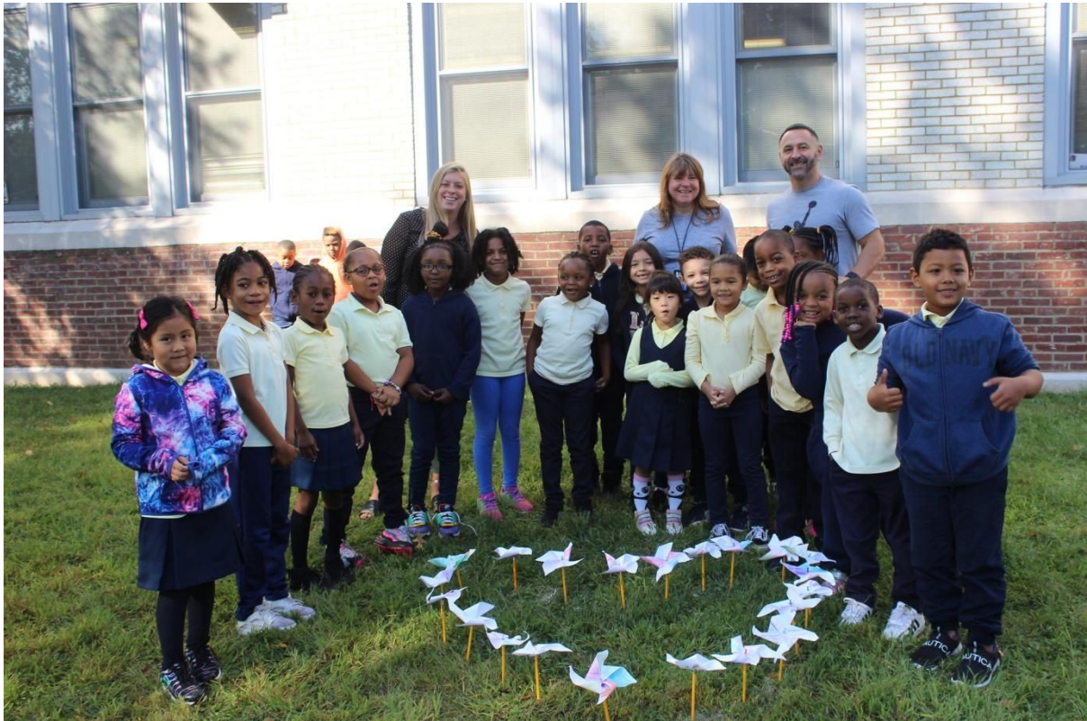
Harrison students, teachers and staff had a blast at their annual Pinwheels for Peace celebration.

Students made their own pinwheels out of pencils and paper to stick on the lawn in various shapes such as hearts and, of course, peace signs. Some pinwheels even had messages on them regarding what peace means to our Harrison students.