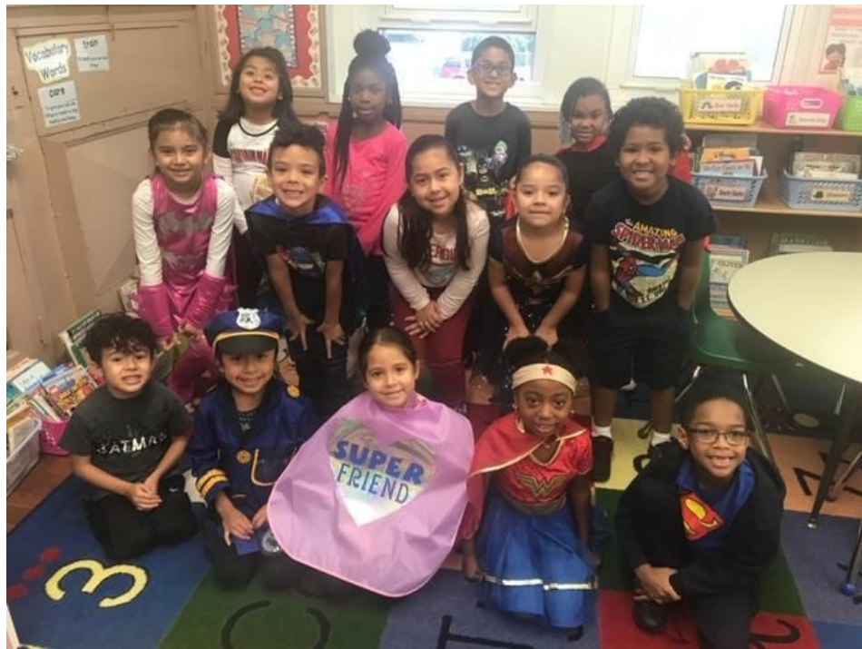
Harrison Elementary School students being “super friends” in their superhero gear for the Week of Respect.

Students also wore sport jerseys to “team up against bullying” and their pajamas to “put bullying to bed” this week.