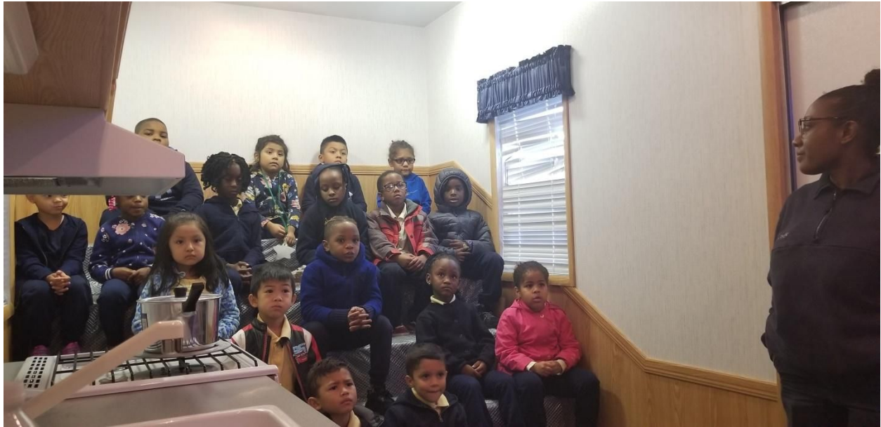
Roselle kindergarteners enjoy their visit in the local fire department's fire simulation trailer to celebrate National Fire Prevention Week.

At the conclusion of the event, each child was promoted to Roselle Junior Firefighter as a special way to end the week.